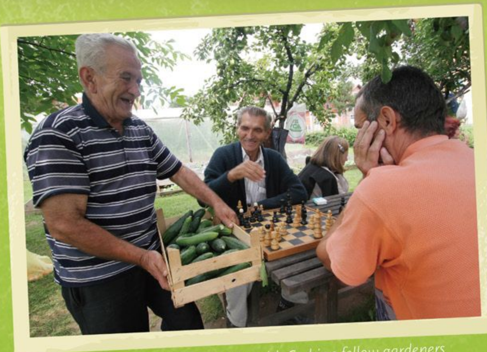
A Muslim man shares his cucumbers with Serbian fellow gardeners

“When these people come to the garden for the first time, they say proudly, ‘I’m a Serb’ or ‘I am a Croat’ or ‘I am a Muslim,’ and they stay in their separate groups. But after 8-10 days, they become gardeners. ”